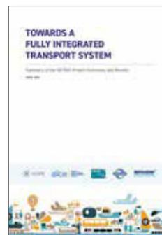
SETRIS final brochure (April 2018)

ECTRI, as an association, also have been participating in nine horizontal projects of high strategic character e.g. NET-TRACK, EURFORUM, DETRA, EUTRAIN and more recently SETRIS, SKILLFUL, TRA 2020, TRA VISIONS 2020 and BE OPEN ; all were funded by the EU FP.