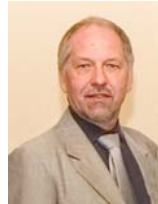
By Kurt Petersen-DTF Treasurer of ECTRI

E CTRI has since Newsletter n°6 was issued been extremely active in contributing to the development of the future European Transport Research Area. The actions have been in three different and complementary areas: expansion and integration, research planning and education and training.