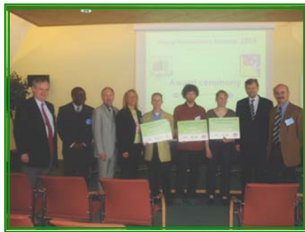
The Winners with the Steering Committee

transport research fields: transport economy, transport sustainability and environment, transport safety, transport civil and road engineering, and intelligent transport systems.