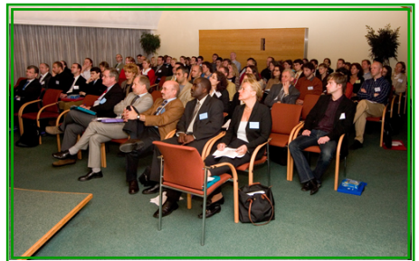
A Plenary session

More information and the papers of the Young Researchers are available on the ECTRI website : http://www.ectri.org/yrs05 .